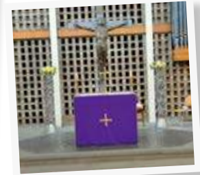
Remembering 160 years of Catholic Care's service users, staff, volunteers, and donors on All Souls Day