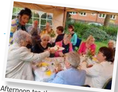
Afternoon tea thanking volunteers