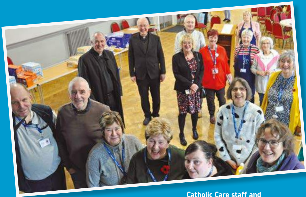
Catholic Care staff and volunteers welcome the Charity's 'Trustees On Tour' to Bradford Community Market

2700 people cared for and helped during 2023