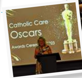
Recognising staff and volunteer achievements at the 'Catholic Care Oscars'