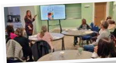
Staff training in mental health awareness