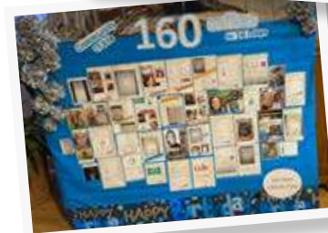
Fundraising events in our 160th year included serving 160 brews of tea and walking 160 miles