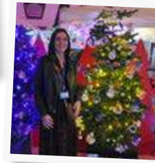
Catholic Care's first participation in the Christmas Tree Festival at St. James' Church in Thornton